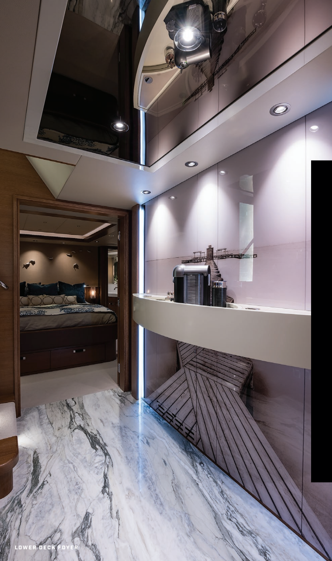
LOWER DECK FOYER